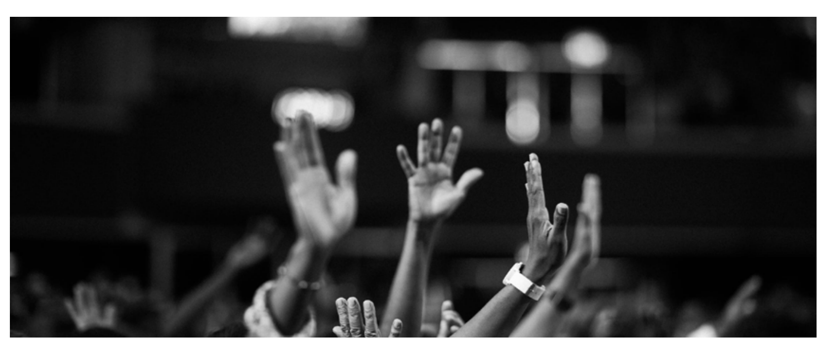
"When you do the common things in life in an uncommon way, you will command the attention of the world." - George Washington Carver

Kabir McNeely continues exploring the world of film and building his acting resume.